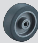
EL Elastomer wheel