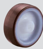
UR Urethane wheel with nylon wheel assembly