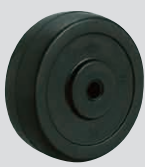
RH Rubber wheel

Refer to P163 for detailed specifications.