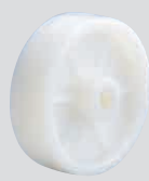
N Nylon wheel