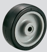
NR Rubber wheel with nylon wheel assembly