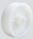
N Nylon wheel

Refer to P160 for detailed specifications.