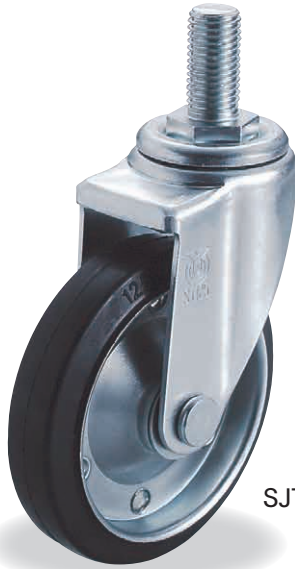
SJT-125W, M20 x 40