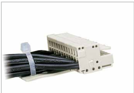
Strain relief plate, for factory assembly, female connector, 2.5 mm pin spacing, light gray, 12-pole, with 733-112/034-000 strain relief plate.