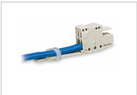
Strain relief plate, for factory assembly, female connector, 2.5 mm pin spacing, light gray, 2-pole, with 733-102/032-000 strain relief plate.