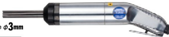
Needle \phi 3mm