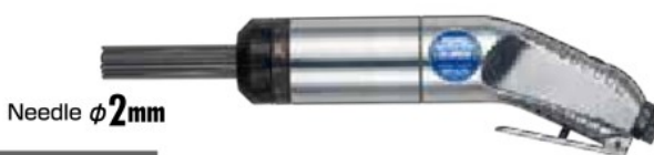
Needle \phi 2mm