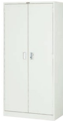
FH52-G19 (double door bookshelf)