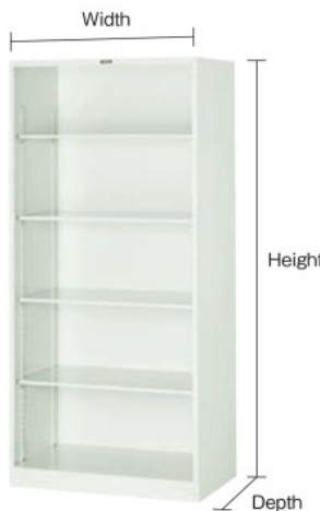
FO52-G19 (open bookshelf)