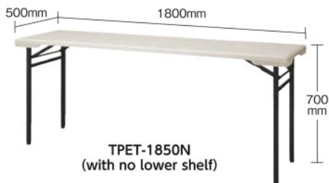
TPET-1850N (with no lower shelf)