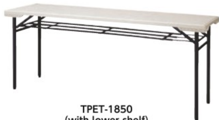
TPET-1850 (with lower shelf)