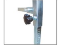
It is easy to match the height with the pitch mark on the leg extendable part.