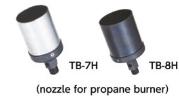
(nozzle for propane burner)