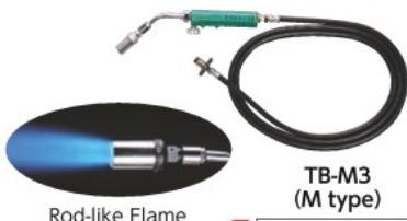
Rod-like Flame TB-M3 (M type)