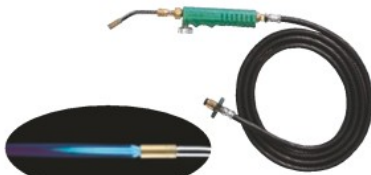
Extra-fine concentrated flame TB-SS1 (SS type)