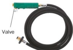
TB-H3MB (hose for propane burner (with valve))