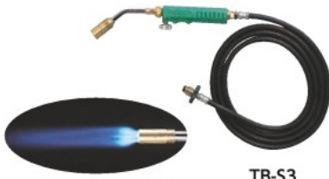
Spiral concentrated flame TB-S3 (S type)