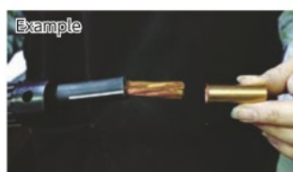
TRUSCO NAKAYAMA CORPORATION

Features • Copper pipe sleeve for wire connection. Origin • Japan