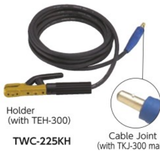
Holder (with TEH-300)