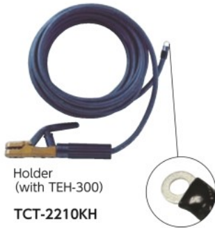
Holder (with TEH-300)