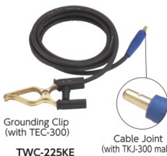
Grounding Clip (with TEC-300)