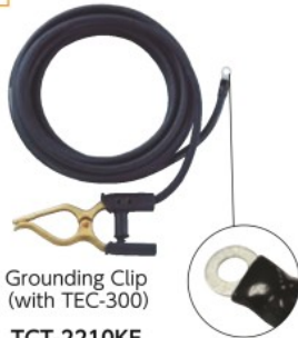
Grounding Clip (with TEC-300)