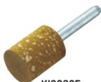
KI2220F (#220, yellow)

Estimated Unit Price per Piece ¥334 to ¥537