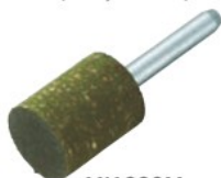
MI1220M (#120, green)