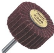
FM4025-320 (outer diameter 40mm)