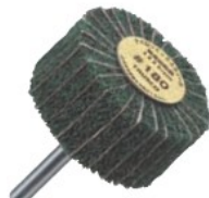
FM4025-180 (outer diameter 40mm)