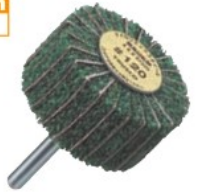
FM4025-120 (outer diameter 40mm)