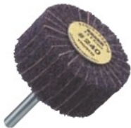
FM4025-240 (outer diameter 40mm)