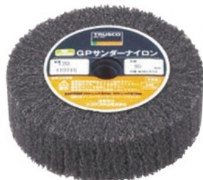
GPSN8025 (outer diameter 80mm)

Outer Diameter 80mm Estimated Unit Price per Piece ¥1,215