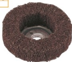
GPN50M (# 120)