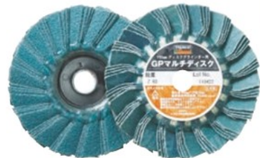
GP100MZ (zirconia for heavy polishing)