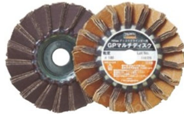
GP100M (aluminum for general metal)