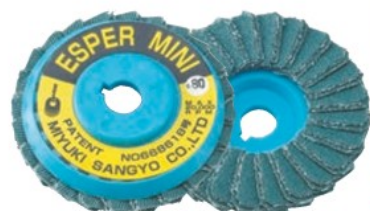
MMEM58Z-80 (zirconia for stainless steel/difficult-to-cut material)