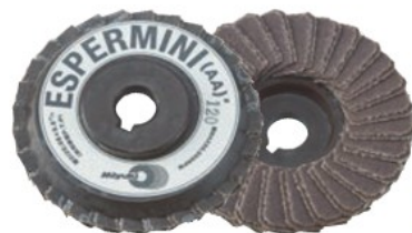
MMEM58A-120 (aluminum for general metal)