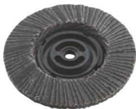
GP100ALZ: 80 (zirconia for stainless steel, difficult-to-cut material)