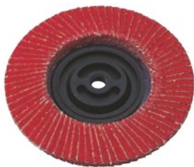
GP100ALC-80 (ceramic for difficult-to-cut material)