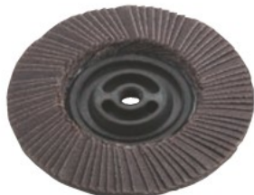
GP100AL: 80 (aluminum for general metal)