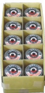
GP100AL-60-100P (100 sheets, aluminum for general metal)