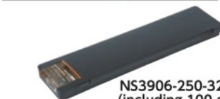
NS3906-250-32-100P (including 100 sheets)