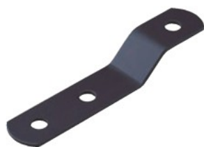
TK19-J3B (steel (black coating finishing))