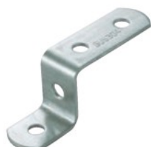
TK19-Z4S (stainless steel)