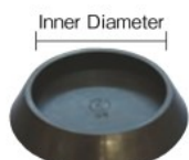
BE-0-652 (flat rubber black/round)

Features •Optimum for protecting round base legs, non-slip, caster top. Materials •Natural Rubber Origin •China