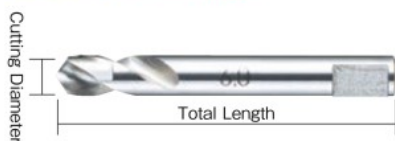
TE645 (center drill)