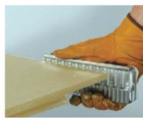
Work horizontally to collect dust