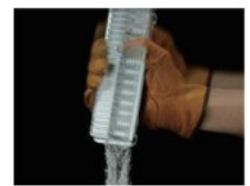
Hold upright to empty dust