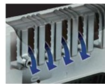
In-handle dust collection