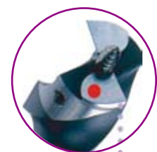
Tungsten Carbide Tips

S=Size O/A=Overall Length T/L=Twist Length SD=Shank-Dia