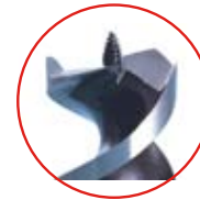
Size 39m/m ~

As contrasted to the bits used in the past, this bit is equipped with an axis usable with an electric drill and is handy for people who require speed.