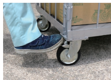
Operating one-touch lock lever