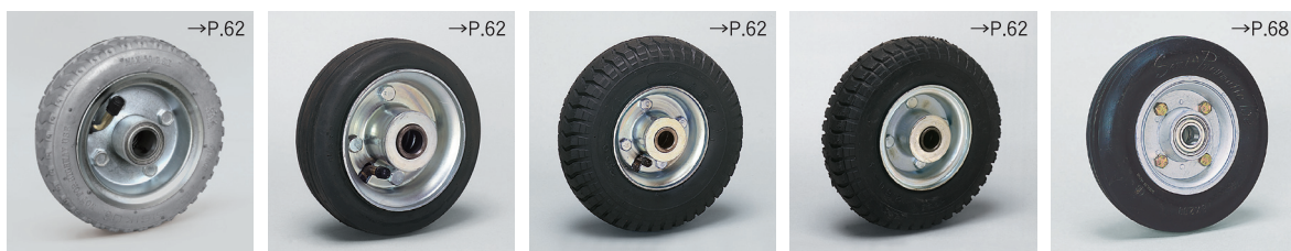
AI (SBR/Gray) 6-2G <Made in China>

See P.62 to P.71 for detailed description.