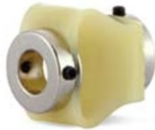
Size: 29, 38