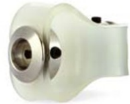
Size: 48, 54