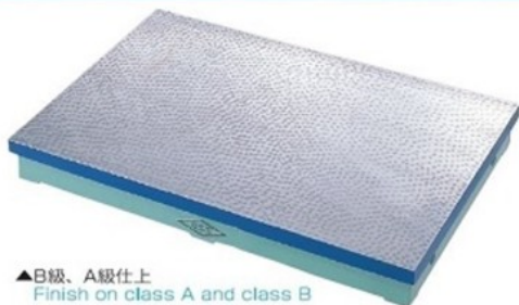
▲B級、A級仕上 Finish on class A and class B