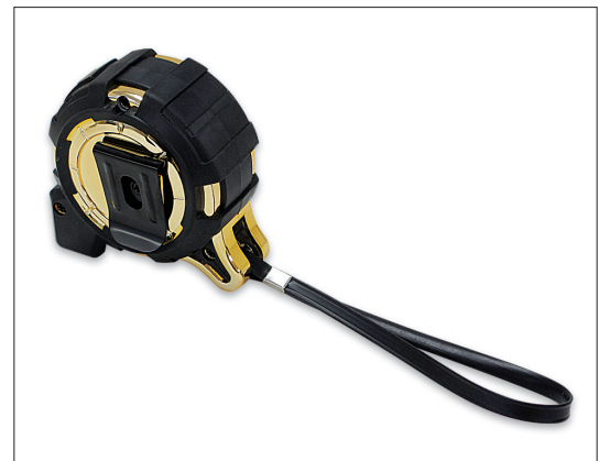
With belt clip and strap for easy carrying