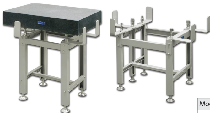
GT-5075J + G5075