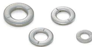
SWAS-VF Washers with Ventilation Grooves

Individual Sales → P.794 | Cleanroom Wash & Packaging → P.792 | Screw Length Adjustment → P.796 | Vibration Resistant → P.795 | Modification process for captive use → P.791 Available / Add'l charge | Cleanroom washed and packed | Available / Add'l charge | Not Available | Please feel free to contact us