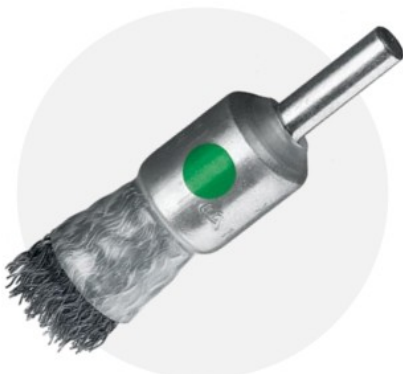
Brushes also available with shrink tubing.