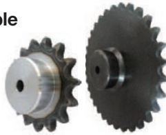
Ground Specification Welded Specification