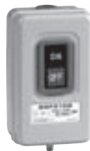
BSF 215B 3