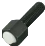
BUH-E 06012 - 08040 (Plain, Plastic Ball)