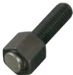
BUH-F 06012 - 08040 (Plain, Steel Ball)