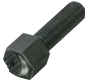
BUH-S 10015 - 24100 (Serrated, Steel Tip)