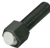
BUH-E 10015~24100 (Plain, Plastic Tip)