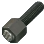
BUH-S 06012 - 08040 (Serrated, Steel Ball)