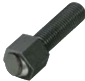
BUH-F 10015 - 24100 (Plain, Steel Tip)