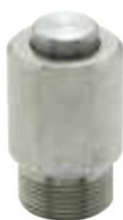
QCOWS (Cylindrical, Stainless Steel)