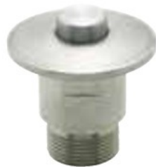
QCOW (Stainless Steel)