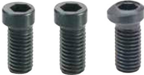
MBCS 04,16 MBCS 06~10 MBCS 12